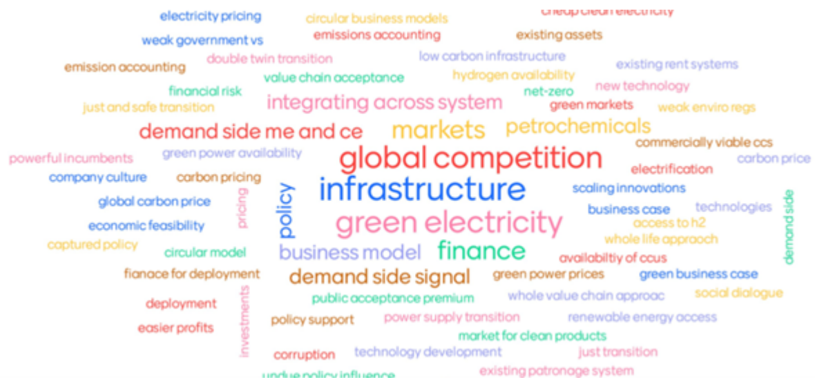
Word cloud of challenges for decarbonizing energy-intensive industries based on stakeholder feedback in the first Sectoral Conversation for Industry